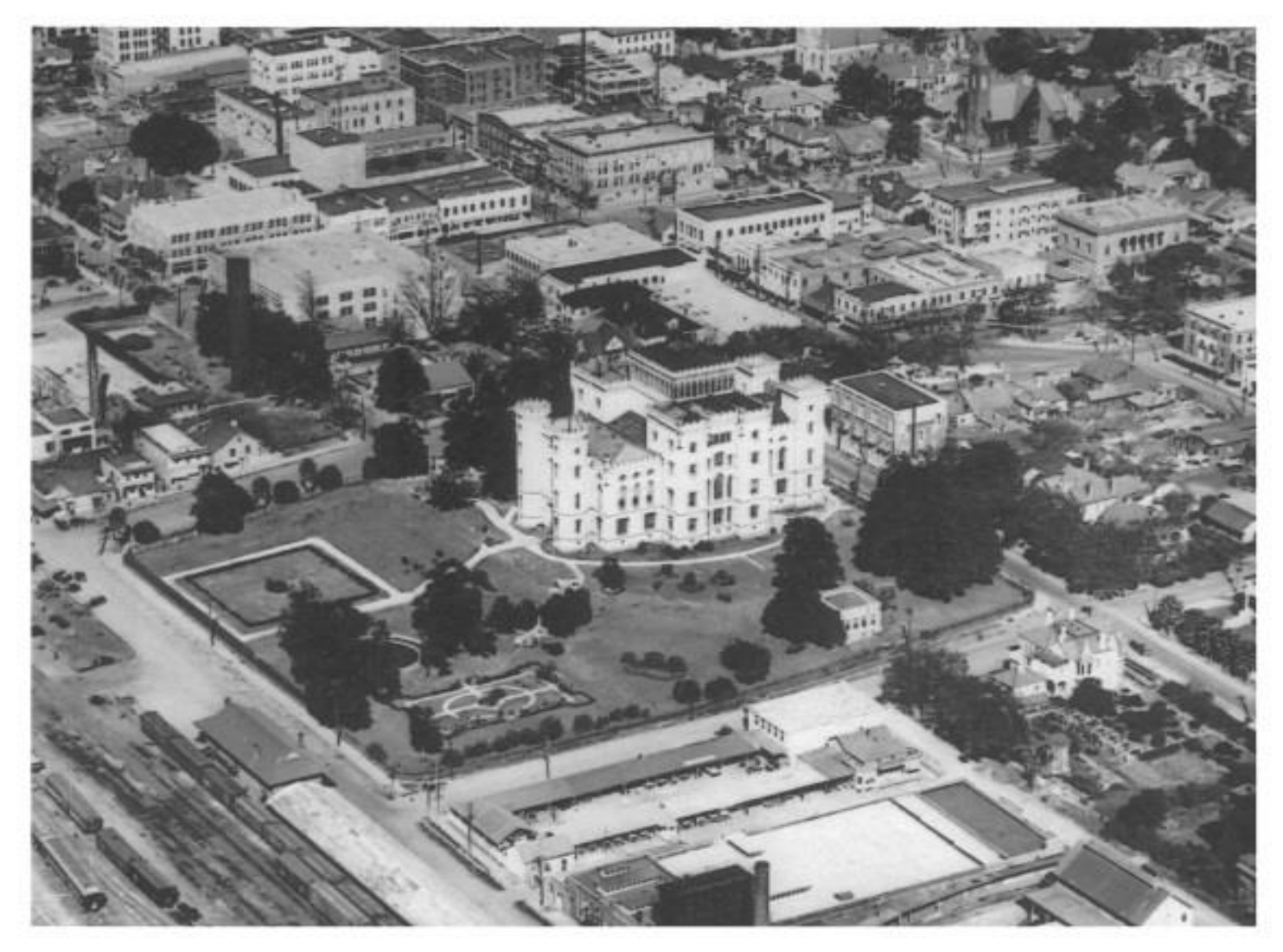
Look carefully for a small white building to the right of the Old State Capitol built in the same style. It was used as a Post Office in later years and then torn down. What do you think its original use was for?