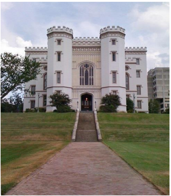
Louisiana's Old State Capitol, 2012